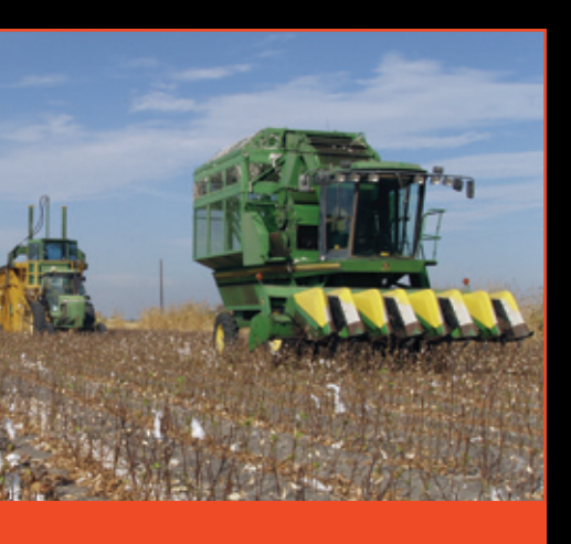
Over 75% of combine fires occur in the engine area. More than 40% of fires are the result of the build-up of chaff and organic materials.